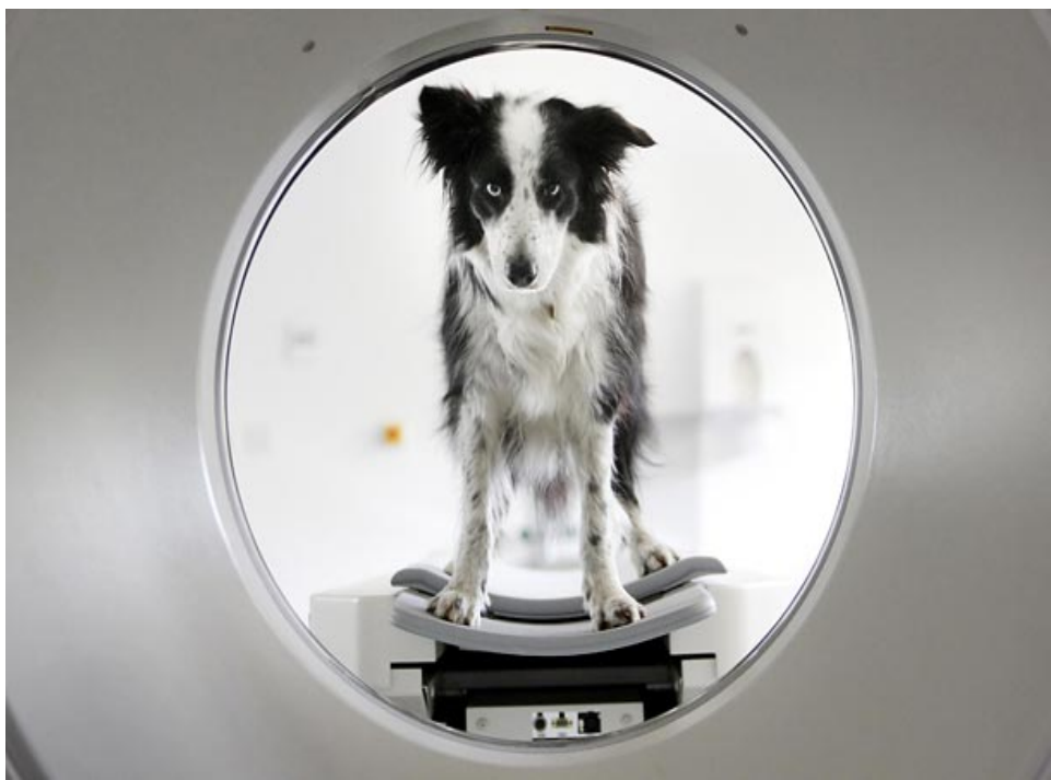
Scrooble the dog, who overcame cancer, looks through a CT scanner during a visit to the new treatment center at the University of Edinburgh's Royal School of Veterinary Studies.