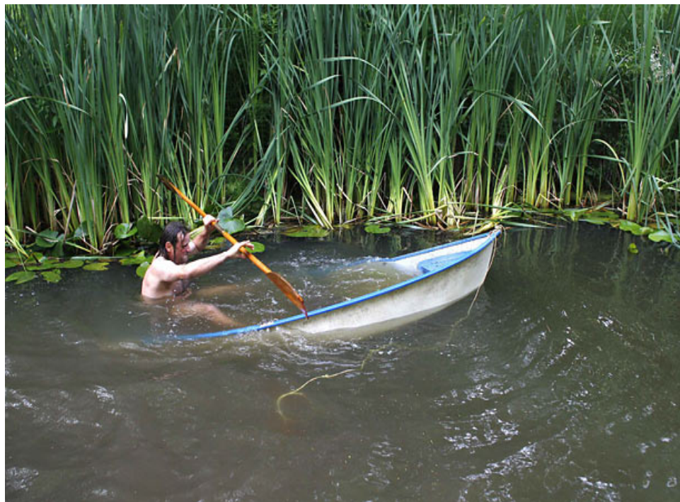
A man struggles to paddle his sinking boat in a lake in Szandavarylja, Hungary.